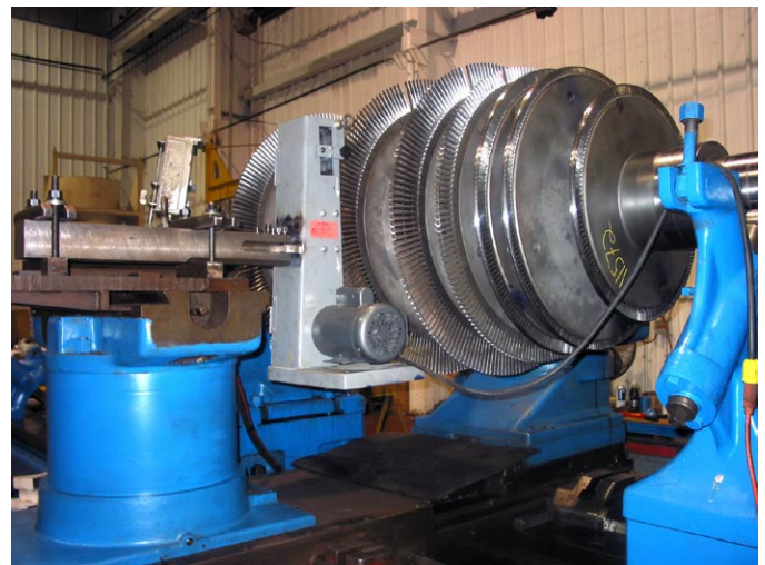
Tip grinding of blades

Elliott repair facilities are ISO 9001:2000 certified and utilize state-of-the-art technology to ensure consistent quality.