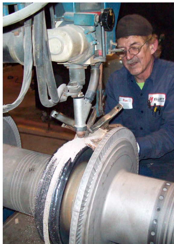
Submerged arc welding repair of a steam turbine disk

With nearly a century of turbomachinery experience and a tradition of excellence, Elliott can provide you with a single, comprehensive source for all your rotating equipment needs. We know what it takes to keep your equipment performance high and your maintenance cost low.