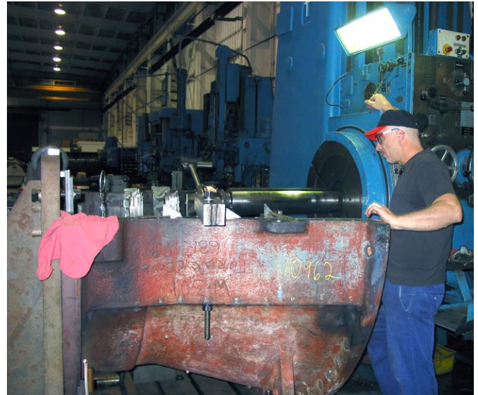
Casing restoration for turbines and compressors