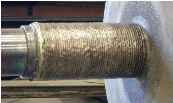
Submerged arc welding

Elliott's Fairfield service center is also a Woodward Authorized Independent Service Facility. We have more than 30 years of experience with Woodward governors, and we repair all Woodward governors and actuators used on steam and gas turbines, diesel generators, and propulsion drives, including TG, SG, EG, UG, PSG, and PG type controls. We use only Woodward manufactured and supplied replacement parts for our repairs. Customers turn to Elliott for all of their Woodward governor requirements – field service, troubleshooting, new and rebuilt controls, installation, testing, calibration, and training.