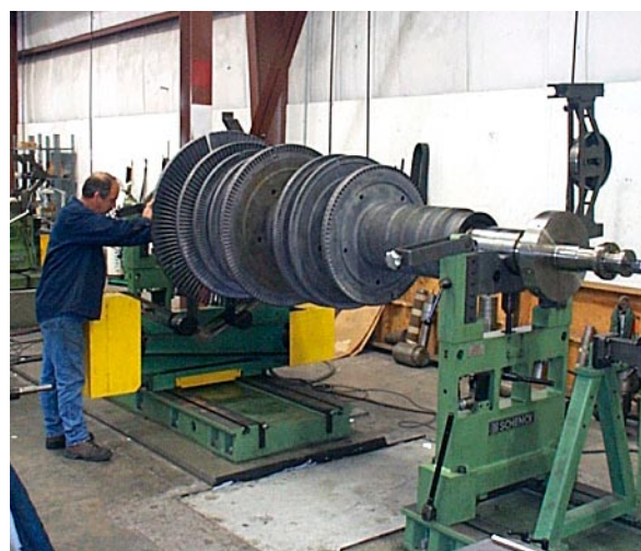
Balance capabilities up to 40,000 lbs