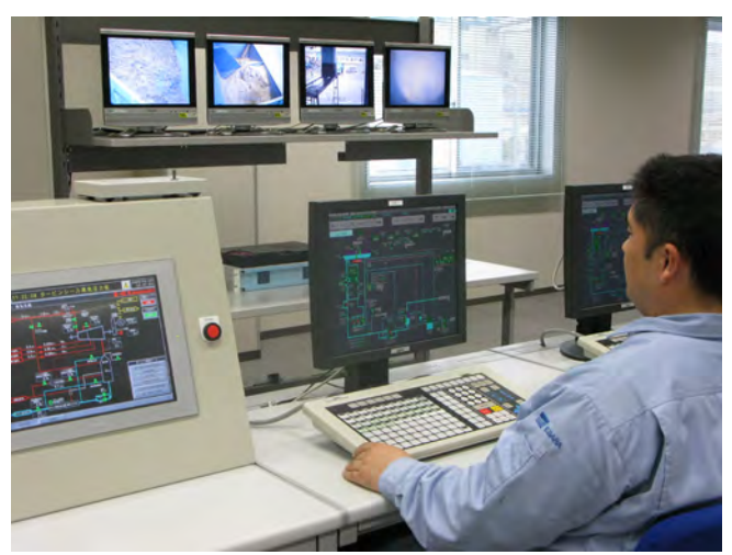
Monitoring and data analysis during testing.