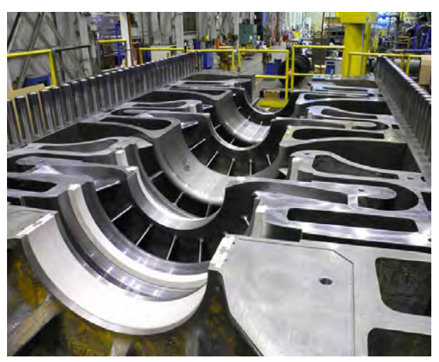
88M6-4 refrigeration compressor with two side loads.

Along with a history of engineering excellence and product innovation, Elliott stands apart in our ability to design and manufacture the large, reliable compressors and steam turbines required for the uninterrupted operation of these very large plants. Elliott's advanced modeling techniques and proven engineering experience result in machinery for refrigeration service custom designed for challenging applications such as efficient side-load mixing. Our steam turbines deliver the power required to drive the processing strings in high capacity ethylene plants. We offer a broad line of multi-stage, multi-valve turbines with horsepower ratings to 140,000 hp (104,398 kW) and speeds to 16,000 rpm.