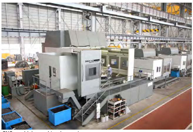
CNC machining and turning center.