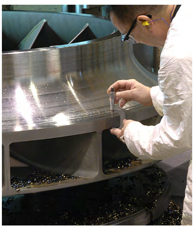
110M6 compressor impeller.

Powerful design and modeling tools enable Elliott engineers to develop the highly efficient compressor and steam turbine designs required for high-volume ethylene production. Computational fluid dynamic (CFD) analysis, finite element analysis (FEA), and solids modeling provide full three-dimensional analyses of the aerodynamic flow path and the structural mechanics of compressor designs. We employ rotor dynamic analysis, compressor selection, and dynamic simulation programs to optimize multi-stage compressor applications. Compressor configurations we design with these tools include those with sidestreams, double flow, back-to-back, and intercooling. Typical steam turbine designs include multiple controlled and uncontrolled extractions, inductions, and double flow exhaust.