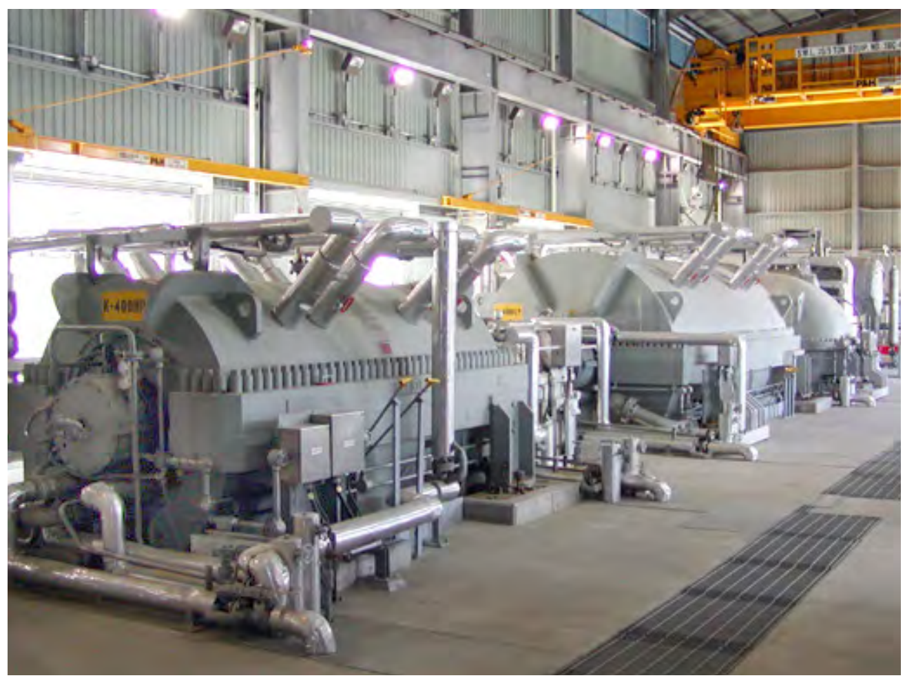
Crack gas train - Elliott 2SNV9 steam turbine driver with 88M6I and 60M6I compressors.

Our experience in crack gas applications allows flexibility in engineering compressor and driver configurations. Compressor strings can include two to four compressor bodies in addition to the specified driver. In typical crack gas applications, steam from the highest pressure header is used as the inlet for the steam turbine. Controlled extraction from the steam turbine typically feeds a medium or low pressure steam header to supply other steam turbines or plant services. A representative driver for a crack gas compression string is the Elliott 2SNV9 double-shell, controlled extraction, condensing steam turbine. This turbine is rated for 1500 psig (103 barg) at 900°F (482°C) and over 70,000 hp (52,199 kW).