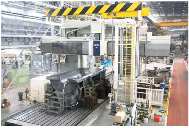
Multi-axis CNC casing machining center.