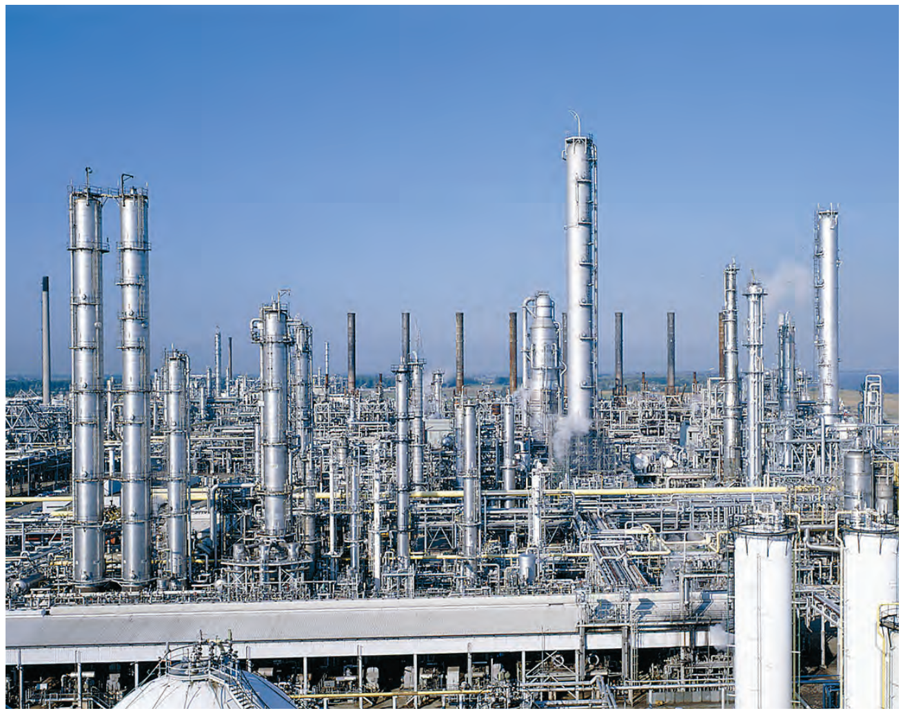
Shell Chemical, Moerdijk, Netherlands.