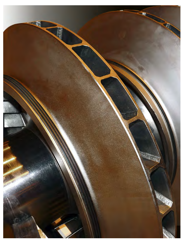
Compressor rotor with POS-E-COAT 523.

Elliott POS-E-COAT® 523 provides excellent releasing properties for polymer build-up, corrosion resistance of the aerodynamic components, and the ability to withstand the harsh liquids or chemical injections typically used for cleaning compressors in crack gas service. Field experience demonstrates that POS-E-COAT 523 helps to maintain rotor dynamics and compressor efficiency under severe fouling conditions significantly longer than other industry coatings. Reducing polymer build-up on the aerodynamic components of a compressor also minimizes the downtime and the cost of materials required to clean the equipment.