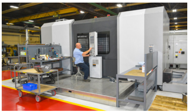
5-Axis CNC machining.