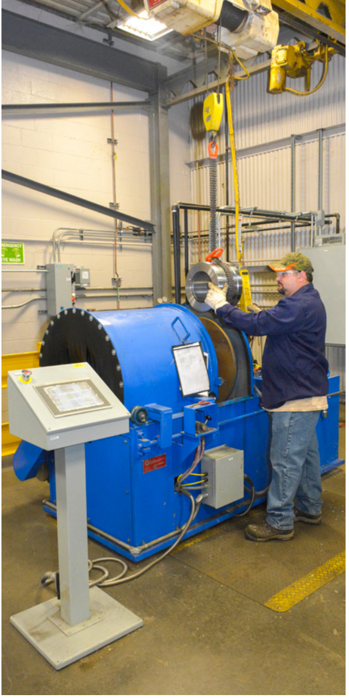
Centrifugal babbitt casting.