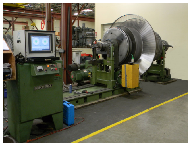
Balancing an Elliott SNV-16 turbine rotor on 40,000-pound balancing machine.

With more than a century of turbomachinery experience and a tradition of excellence, Elliott can provide you with a single, comprehensive source for all your rotating equipment needs. We know what it takes to keep your equipment performance high and your maintenance cost low.