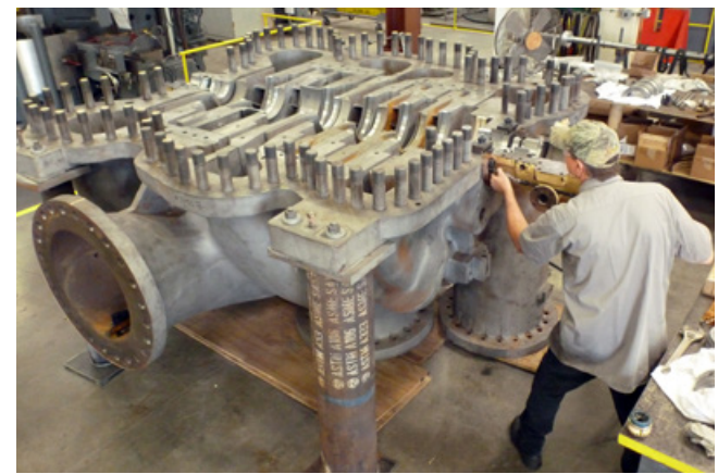
Overhaul and reapplication of a non-Elliott compressor with Elliott components and nameplate.