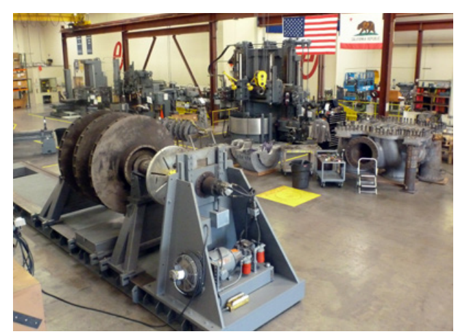
Machining an Elliott 103M compressor rotor on a 110-inch lathe.