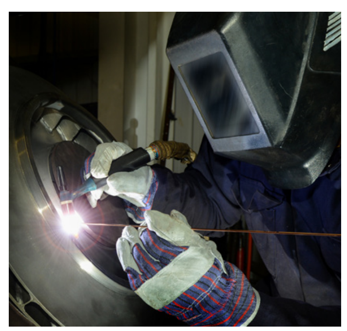
TIG weld repair of an impeller.