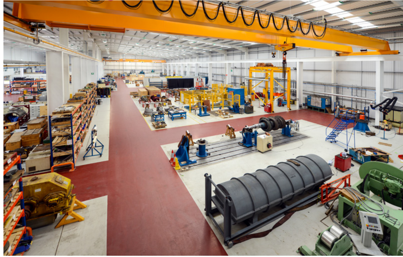
The 58,000-square-meter facility has a 30-ton crane capacity.