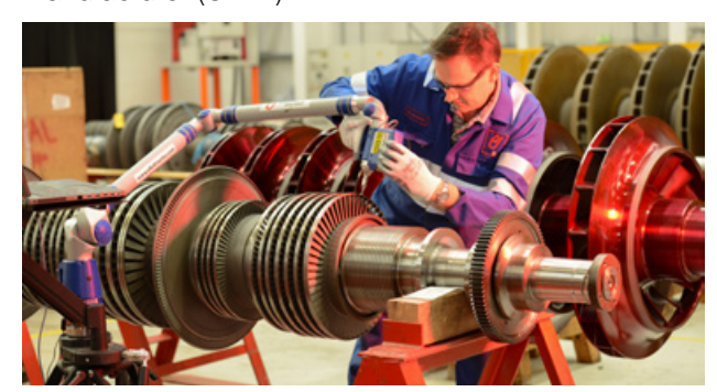
Using a portable coordinate measuring machine to reverse engineer a turbine rotor.

Elliott Group's global service network provides a single, comprehensive source for all turbomachinery service needs, regardless of the original equipment manufacturer (OEM.)