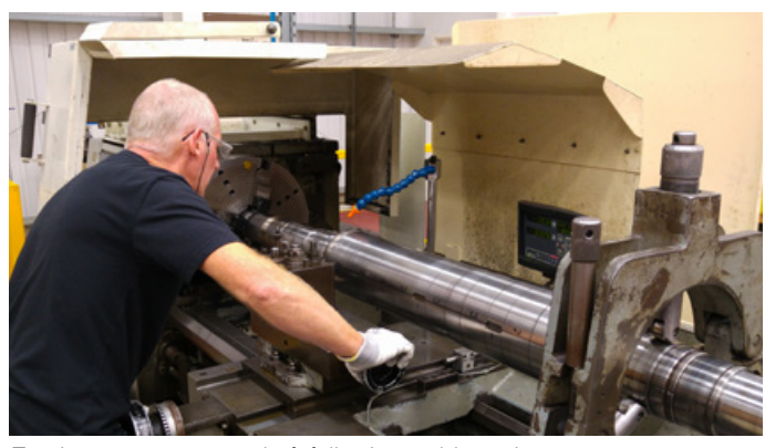
Turning a compressor shaft following weld repair.