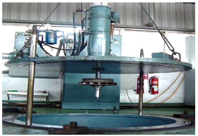
Preparing to balance an Elliott 25M impeller in a spin pit.