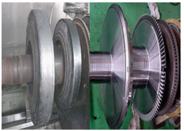
Disc buildup of a steam turbine rotor using submerged arc welding.