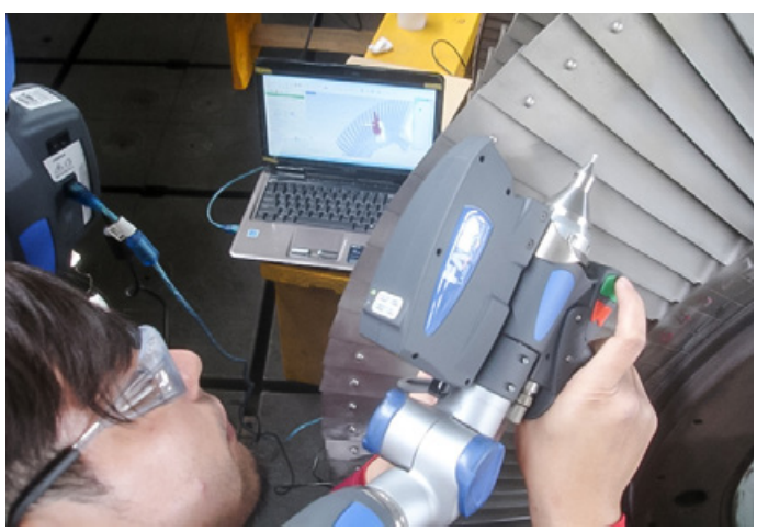
An Elliott technician measuring turbine blades using a FARO arm.