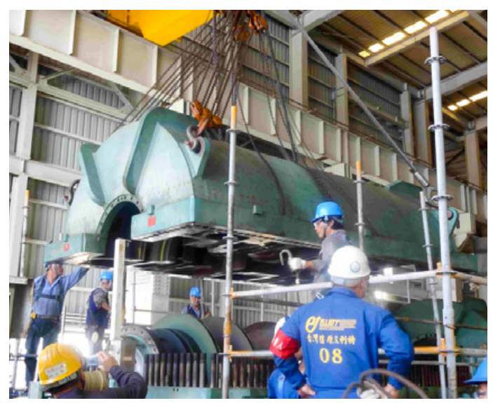
An Elliott field service crew removing an upper compressor casing.