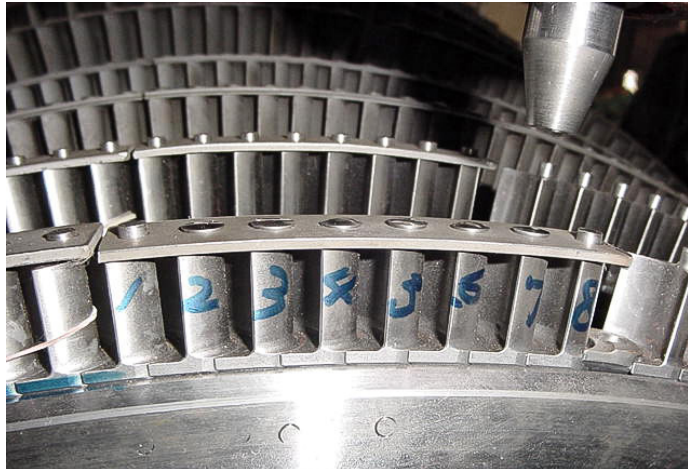
Peening a steam turbine rotor at Elliott Taiwan.