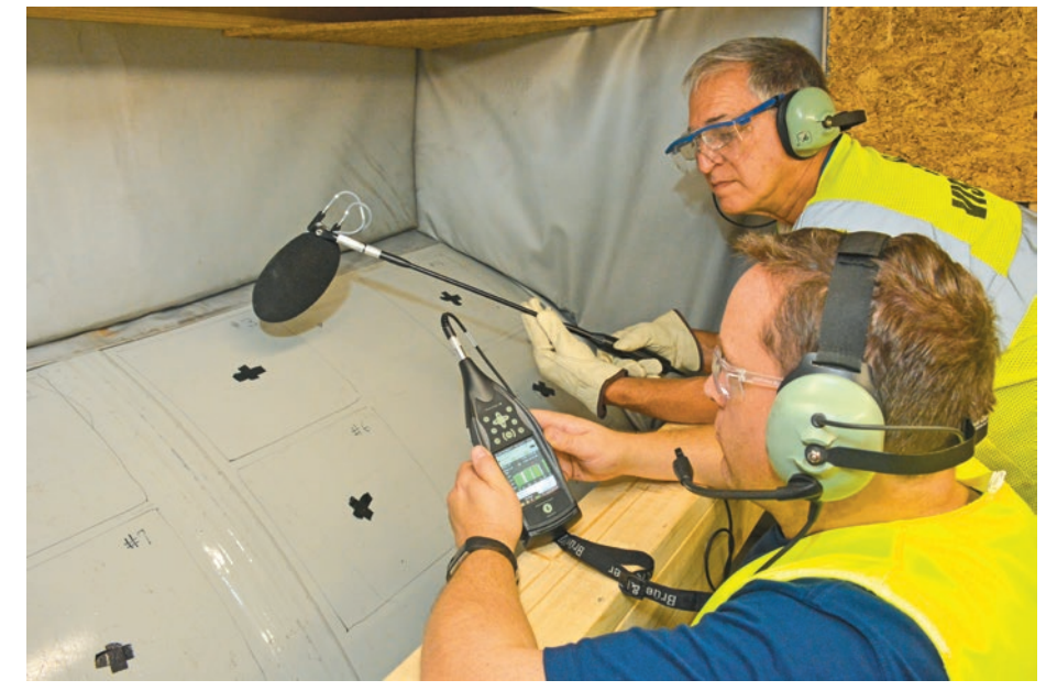
Figure 2. Noise measurement team collecting the sound intensity data inside sealed enclosure on the compressor casing

Acoustic blankets on the main compressor casing, which were not actually required for the application, showed a nearly 20-dBA reduction for predominant impeller blade passing frequency components. Tests on the bearing housings and casing pedestals showed that blankets were not needed in this case, but in other situa-