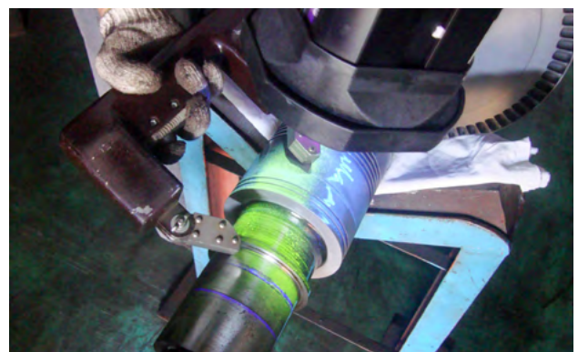
Magnetic particle inspection.