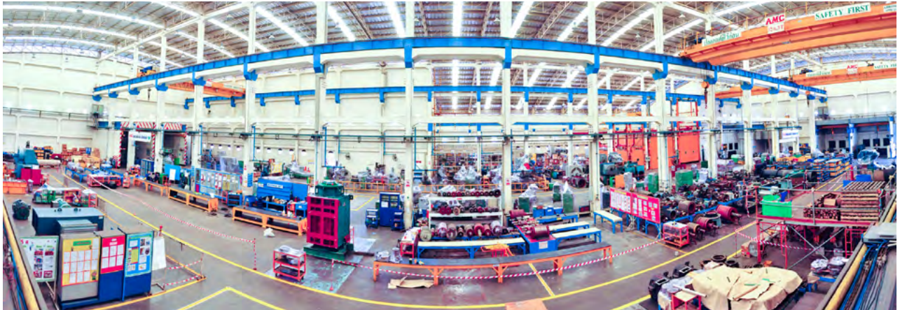
AMC shop floor.

Elliott Group and Asia Motor Service Center Company (AMC) have teamed up to provide turbomachinery rotor inspection services in Thailand. Elliott and AMC will leverage their combined resources and capabilities to become the qualified local service provider for rotor inspection and service in Thailand.