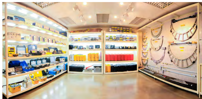
AMC equipment storage room.

Email: ppeeriya@elliott-turbo.com or info-eles@elliott-turbo.com