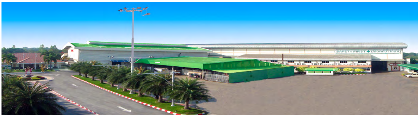
AMC workshop in Pathum Thani province.