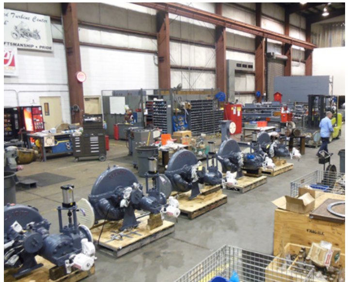
Elliott YR steam turbines staged for delivery to a Louisiana petrochemical plant.