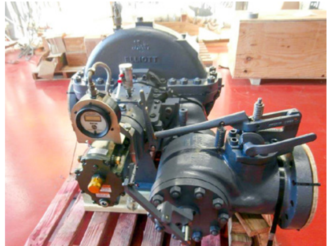
Single-stage overhaul, upgrade, rerate, and repair.

With more than a century of turbomachinery experience and a tradition of excellence, Elliott can provide you with a single, comprehensive source for all your rotating equipment needs. We know what it takes to keep your equipment performance high and your maintenance cost low.