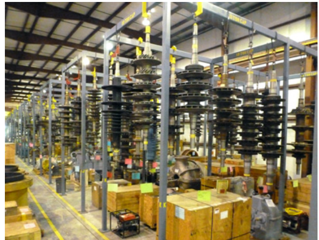
Climate-controlled rotor and high-value asset storage.