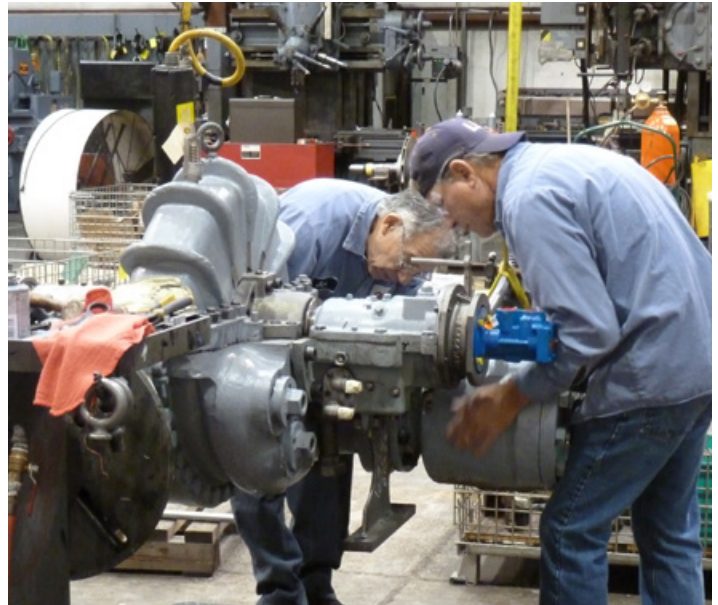
Reassembly of a YR steam turbine.