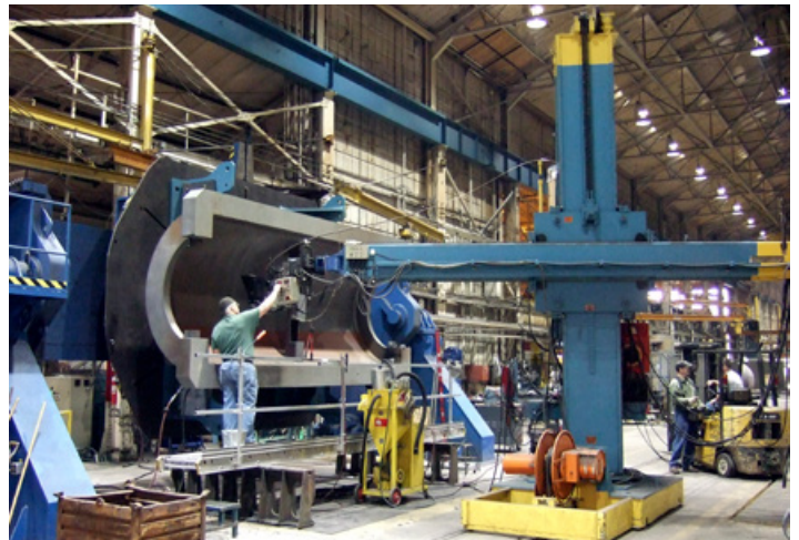
Automatic submerged arc welding