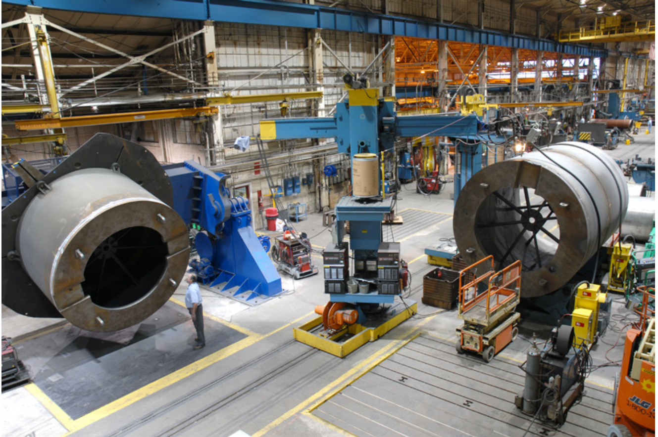
Capacity to manage multiple projects

Elliott's Jeannette facility fabricates precisely engineered stationary components for very large and very high-pressure centrifugal compressors, steam turbines and hot gas expanders. The capabilities of our skilled, experienced work force include welding, burning, pressing, heat treating and grinding of casing walls, flanges, endplates and nozzles. Welding capabilities include automatic submerged and flux core arc welding, shielded metal arc welding, and TIG welding for all thicknesses.