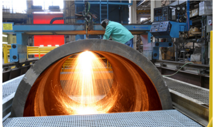
60MB casing on burn table