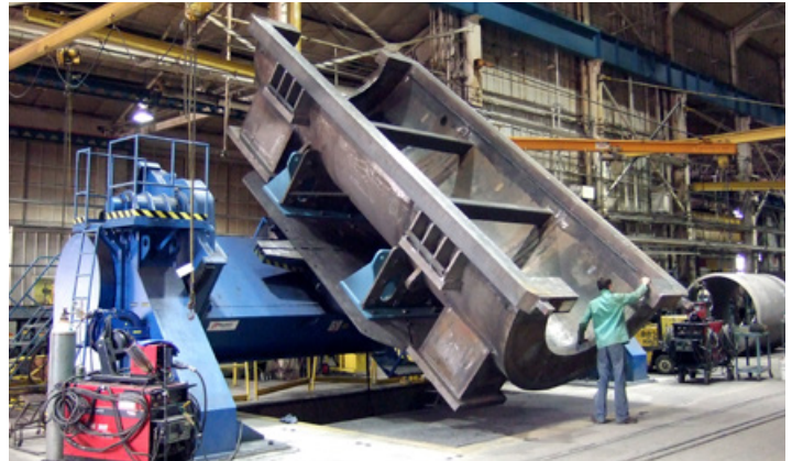
110M casing on weldment positioner