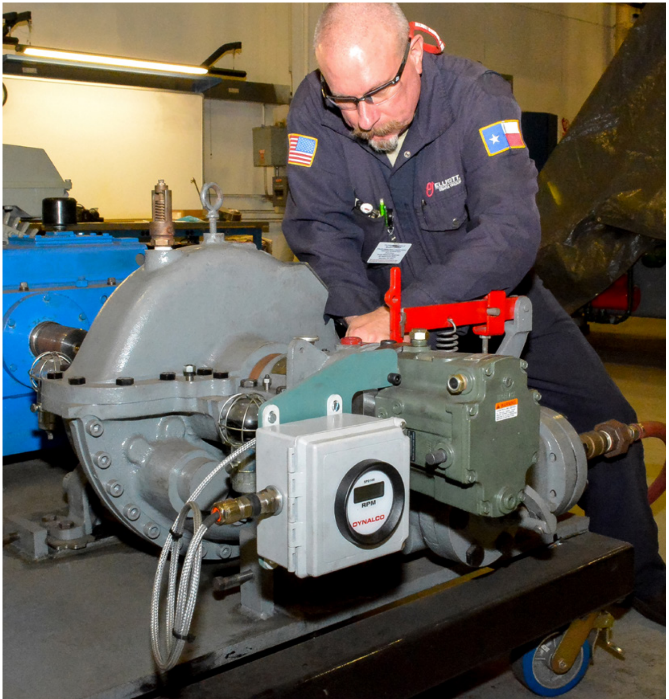
Elliott TG Governor Tachometer Kit being installed on a YR turbine.

When our tachometer is installed on your steam turbine, you will be able to quickly see an accurate reading of your turbine's speed during startup, during normal operation, and when adjusting trip speed. The four-digit, LCD display is easy to read so you can immediately determine if your turbine is running within or outside its normal operating parameters. The ongoing speed reading will allow you to react fast and make adjustments, when necessary.